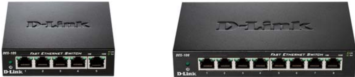
DES-105/108 10/100Mbps Fast Ethernet Switch

The figure below shows the front panel of the DES-105/108.